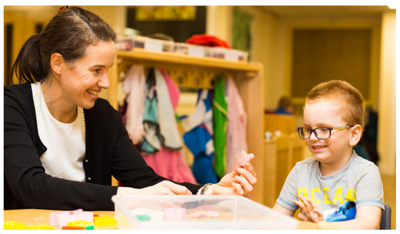
Child Dynamix, which received investment from Social and Sustainable Capital

Child Dynamix reaches more than 6,000 people a year across Hull and the Humber through three different sites. They provide youth clubs, children's centres and parent peer mentoring for people living in some of the most deprived areas of the UK.