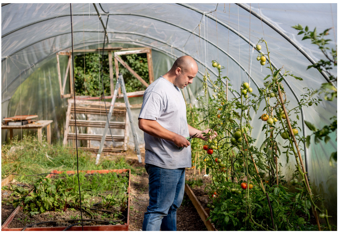
Emmaus Village Carlton, which received investment from Charity Bank

Increasingly social bank loans are contributing to social enterprise growth and sustainability. For example, 81% of projects funded by <u>Charity Bank</u> wouldn't have gone ahead without its support. 69% of their investees said their services grew as a result of the loan, while 78% improved the quality of their services. Meanwhile 42% of organisations said they would have gone under without the loan.