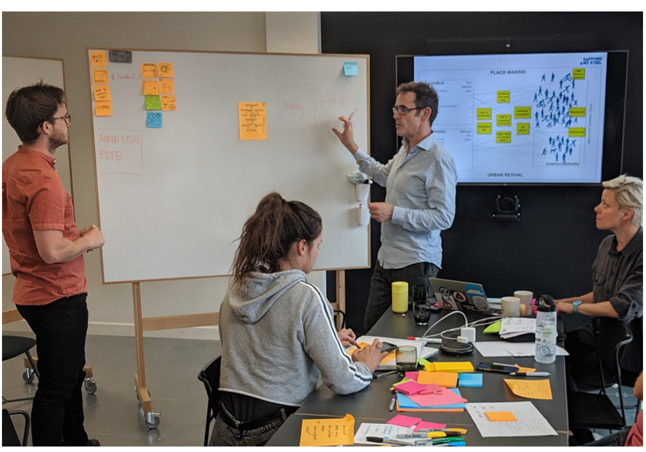
Bethnal Green Ventures