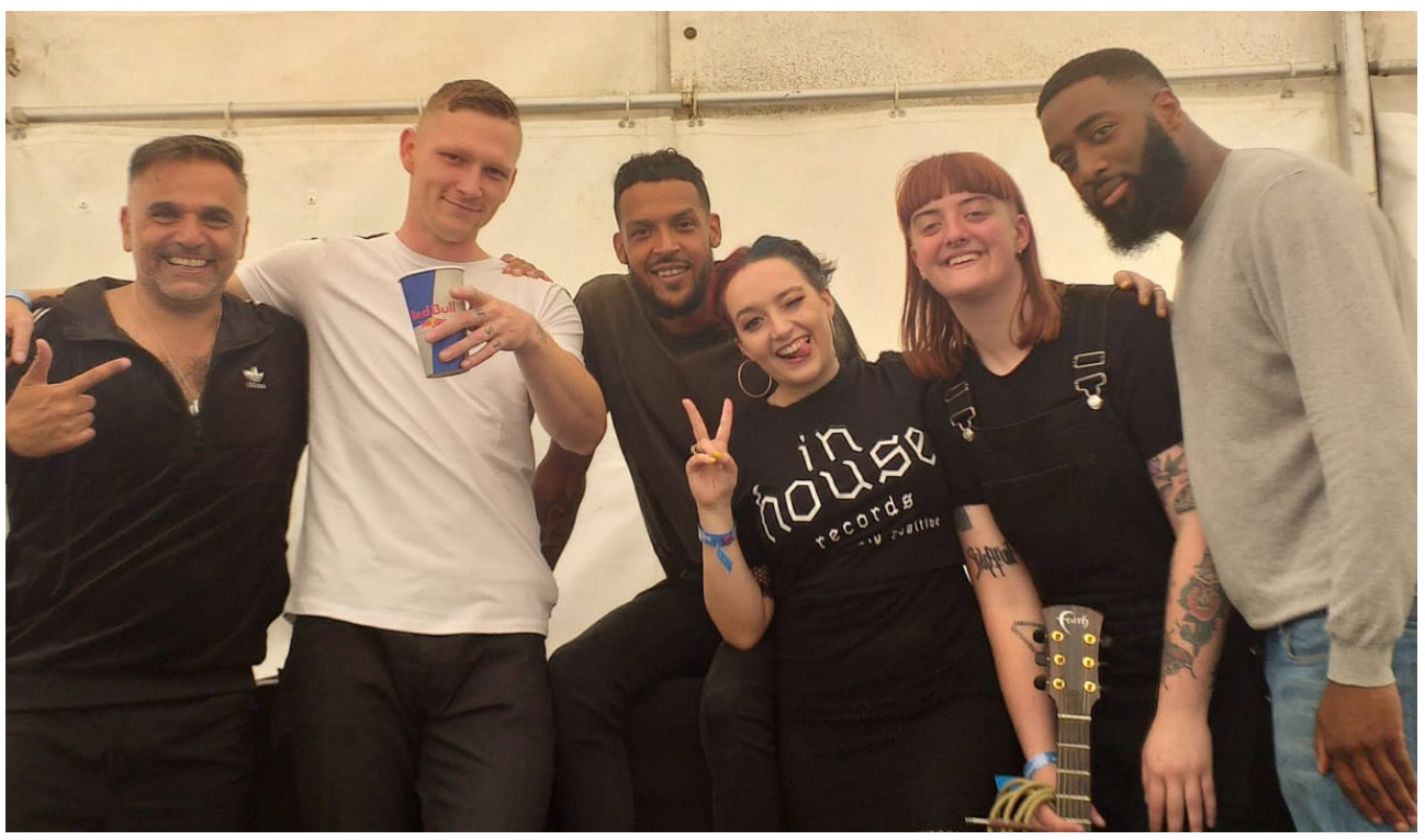
InHouse Records, which received investment from Nesta Impact Investments

As part of the investment process, InHouse received one-to-one support to develop the way it monitors and evaluates the impact of its work. While it had already embedded systems for collecting regular evaluation data, working together with Nesta's Cultural Impact Development Fund has helped InHouse begin to take this to the next level. InHouse also received support to identify the wider evidence base on the effectiveness of music-based interventions in the criminal justice sector. This allowed it to flesh out its theory of change and articulate more clearly how its work will contribute to its long-term goal of reducing re-offending.