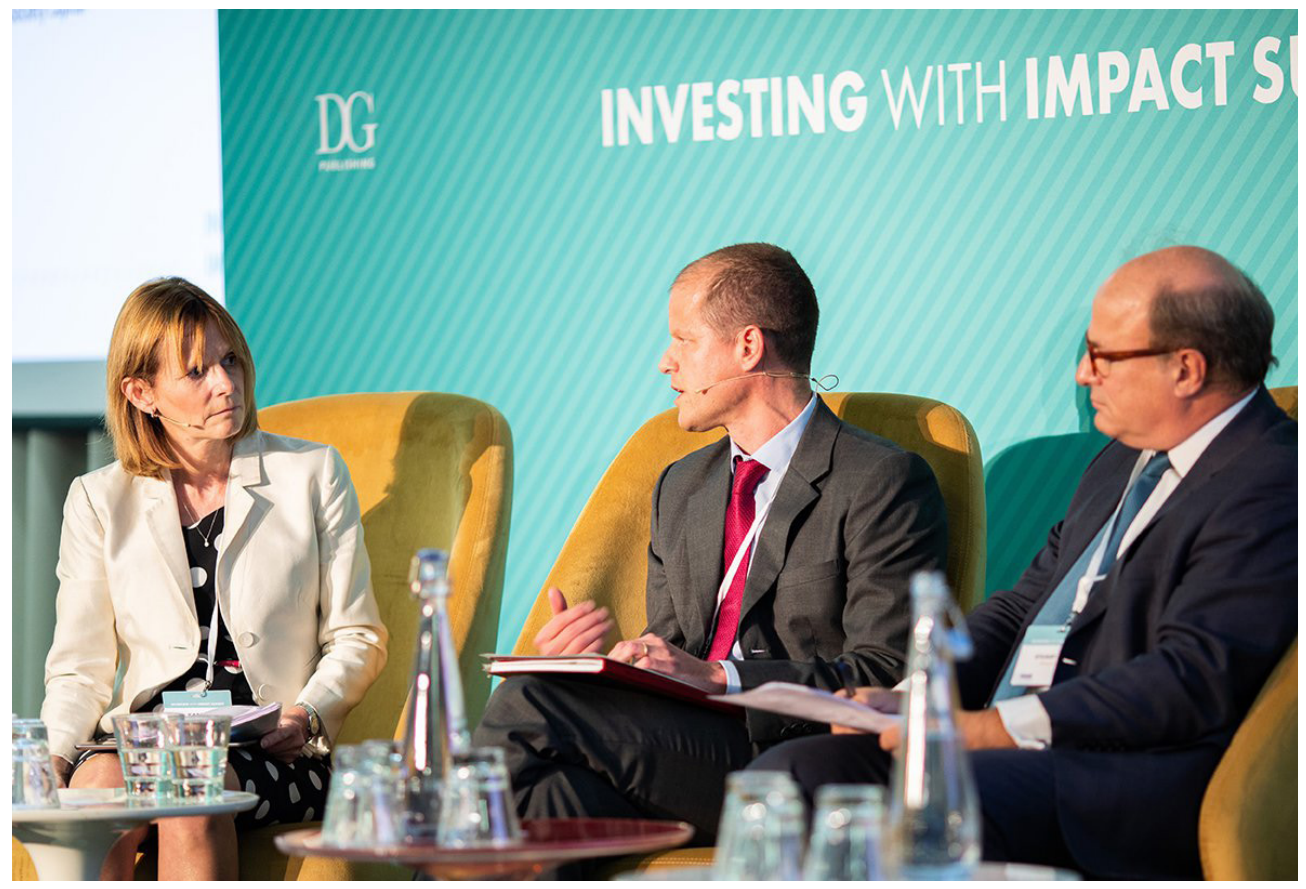
Investing for Impact Summit

Barriers to investing for impact, particularly 'high impact' investments in private markets, still exist – we have much to do to make investing more accessible. Institutional investors often struggle to find opportunities with enough scale and track record, while individual investors face a lack of retail-friendly investment products.