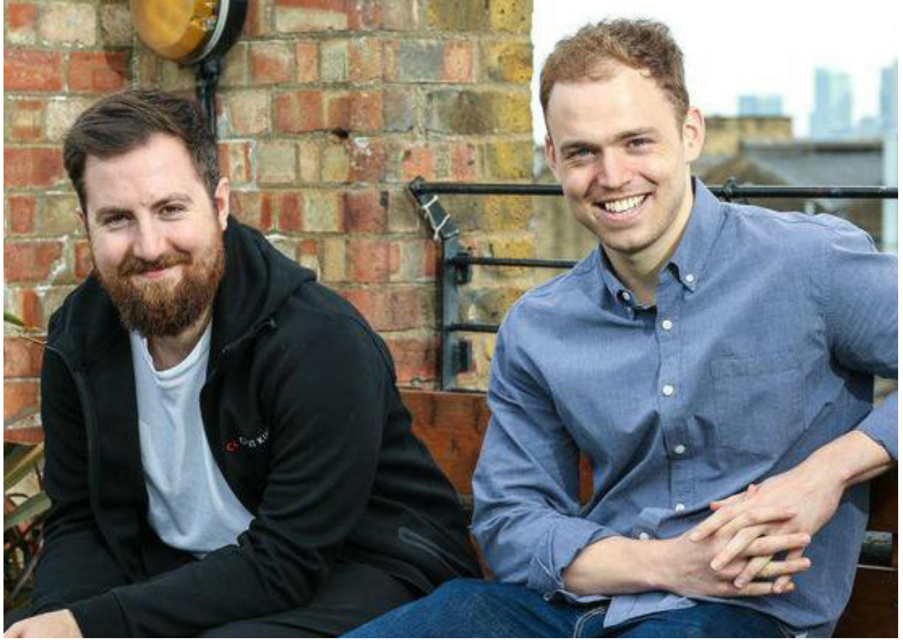
Credit Kudos, which received investment from the Fair by Design Fund

We think there are two drivers here. Firstly, in these models a single new customer (i.e. a business) unlocks multiple new end customers. Secondly, in these models end users often don't pay for the product, which accelerates adoption if a user might otherwise have been unable to afford the product or service. The classic example is a government payer, as is the case with Togetherall and the NHS . There are also cross-subsidy models, where a number of paying users means others with potentially less ability to pay can access freemium content. There are other examples of using innovative dynamics around who is the customer and who is the beneficiary to drive impact and financial returns. For instance, Mush, a platform in our portfolio that lets new, first-time mothers connect and support each other through the challenges of parenthood, has recently introduced a paid option to supplement its free content.