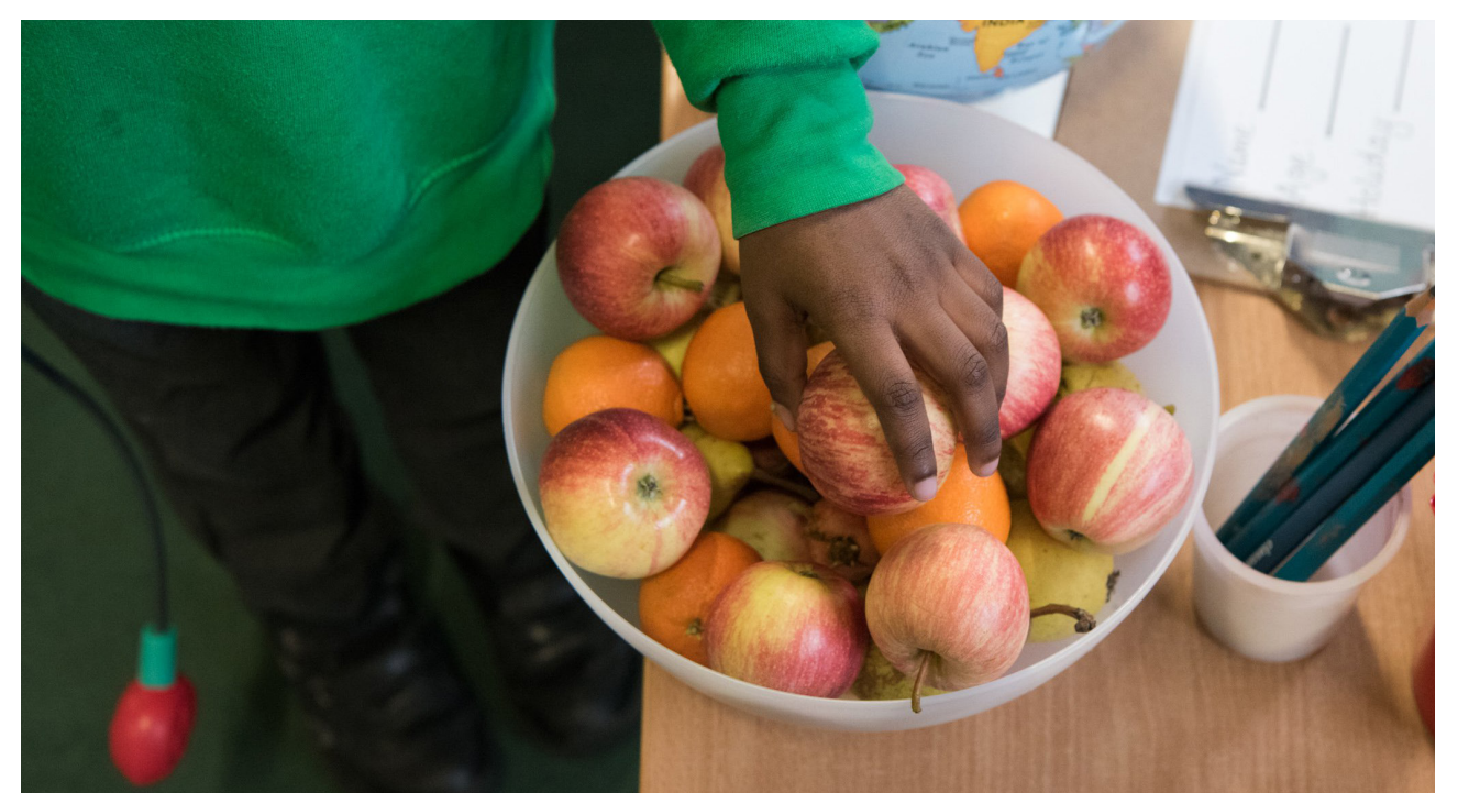
Guy's and St Thomas' Charity

The Fund aims to accelerate a change in purchasing habits by improving access to healthier, affordable food, eventually lowering childhood obesity rates. While the initiative has only just begun, its associated venture accelerator, managed by Mission Ventures, has already chosen its first seven snack brands to take on unhealthy products and we will be tracking progress.