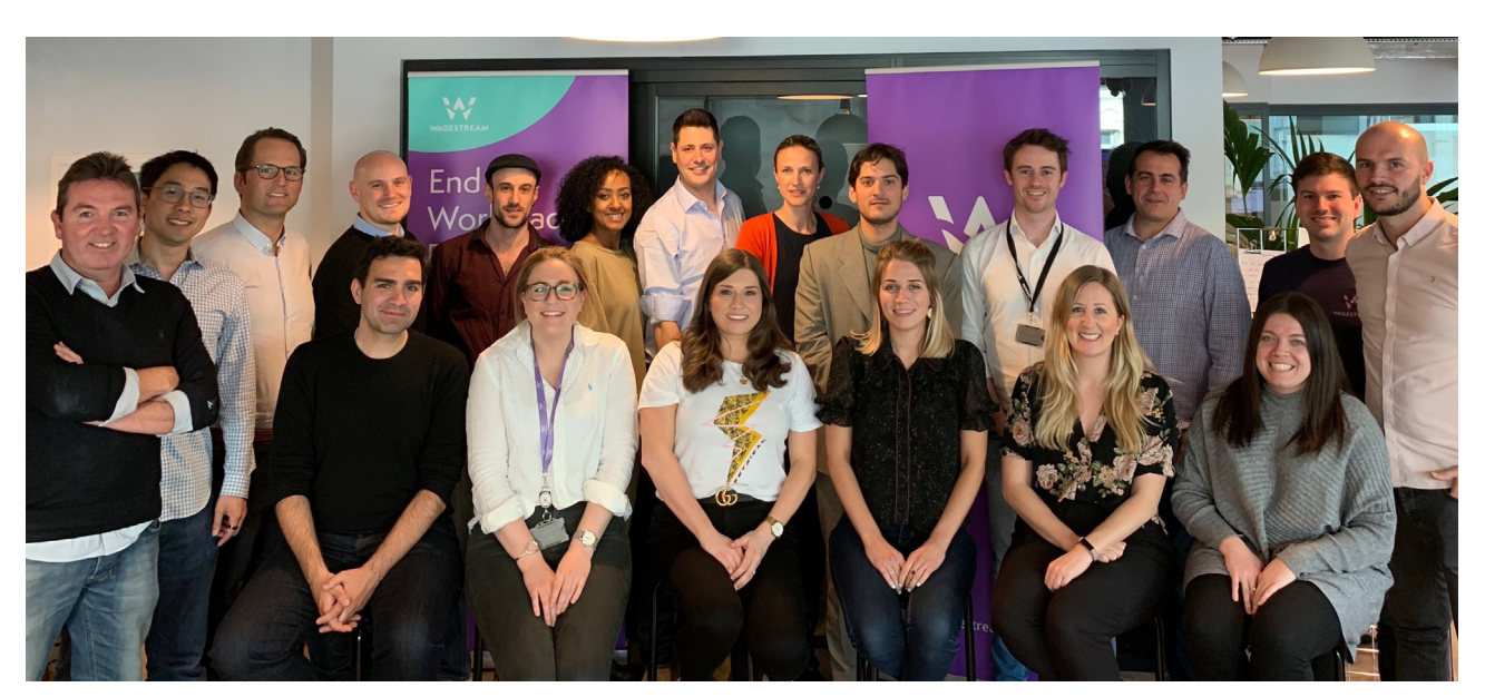
Wagestream, which received investment from the Fair by Design Fund \,

Over 100 companies with 350,000 employees have joined Wagestream, including the NHS, Rentokil Initial and David Lloyd. Wagestream reports that 42% of users avoid turning to a payday lender, 37% avoid going overdrawn, and 65% are able to cover an unexpected bill with their own wages. The employers using Wagestream have seen a 16% reduction in employees leaving their business, while 82% of Wagestream users feel more positive about their employer due to being able to access their earned wages throughout the month.